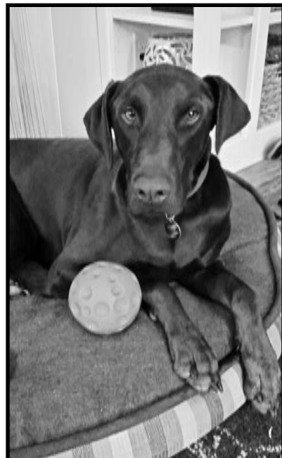
"Bentley" Sobraske of Atascadero