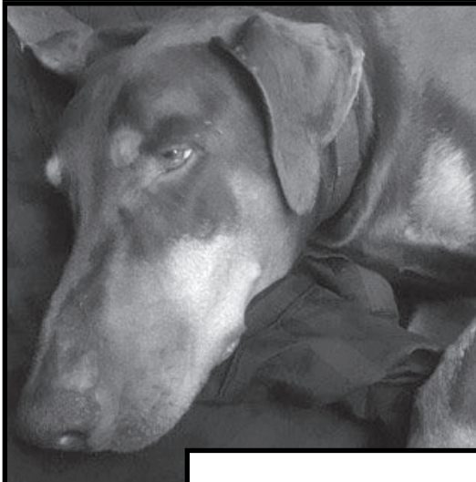
"Teddy" Kolchins of Calabasas

"I have found the one whom my soul loves." -Song of Solomon 3:4