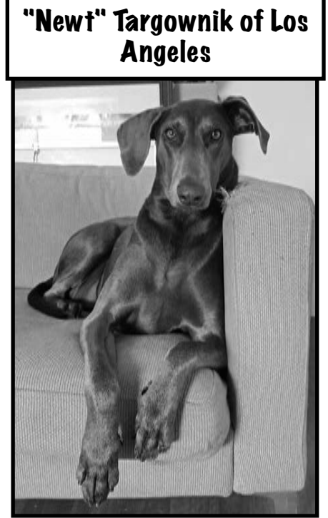
"Newt" Targownik of Los Angeles