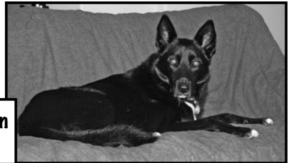
"Dottie" Axelsen of Bend, OR