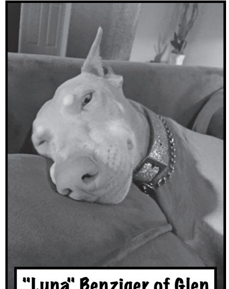
"Luna" Benziger of Glen Ellen