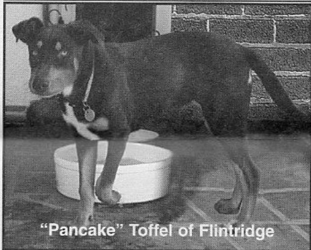
"Pancake" Toffel of Flintridge

Sorry we could not include all of your wonderful photos...yet. Keep them coming, and we'll print as many as we can.