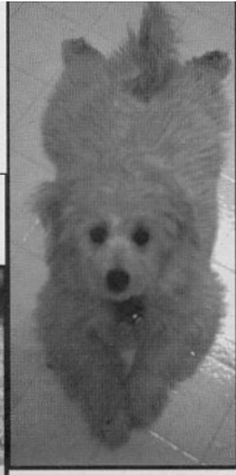
"TIFFANY" Chin of Granada Hills