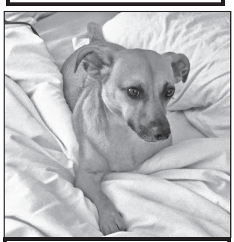
"Finley" Floyd of Mission Viejo