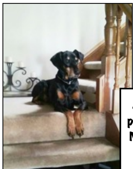
"Bella" Pollak of Moreno Valley