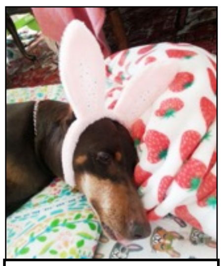
"Sierra" Playfair of Goldendale, WA